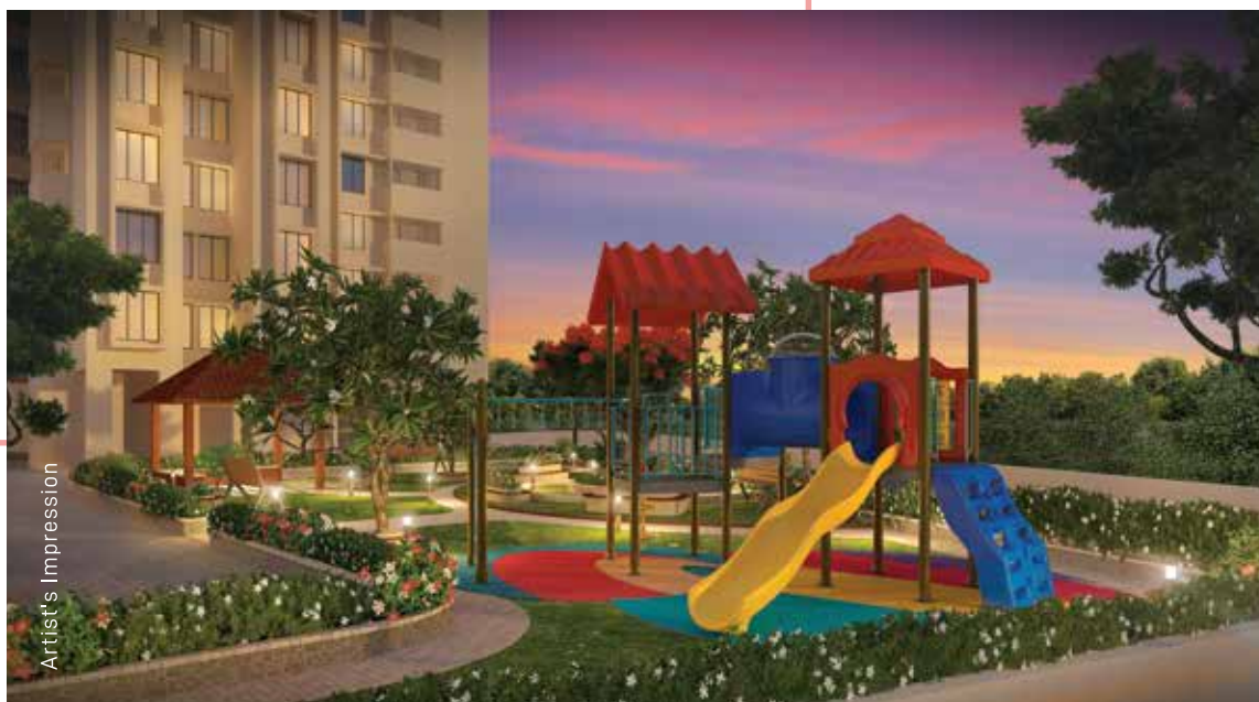
KIDS' PLAY AREA ●